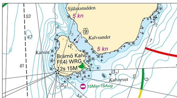
Bird sanctuary S