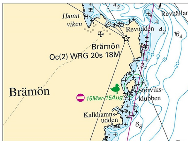
Bird sanctuary NE